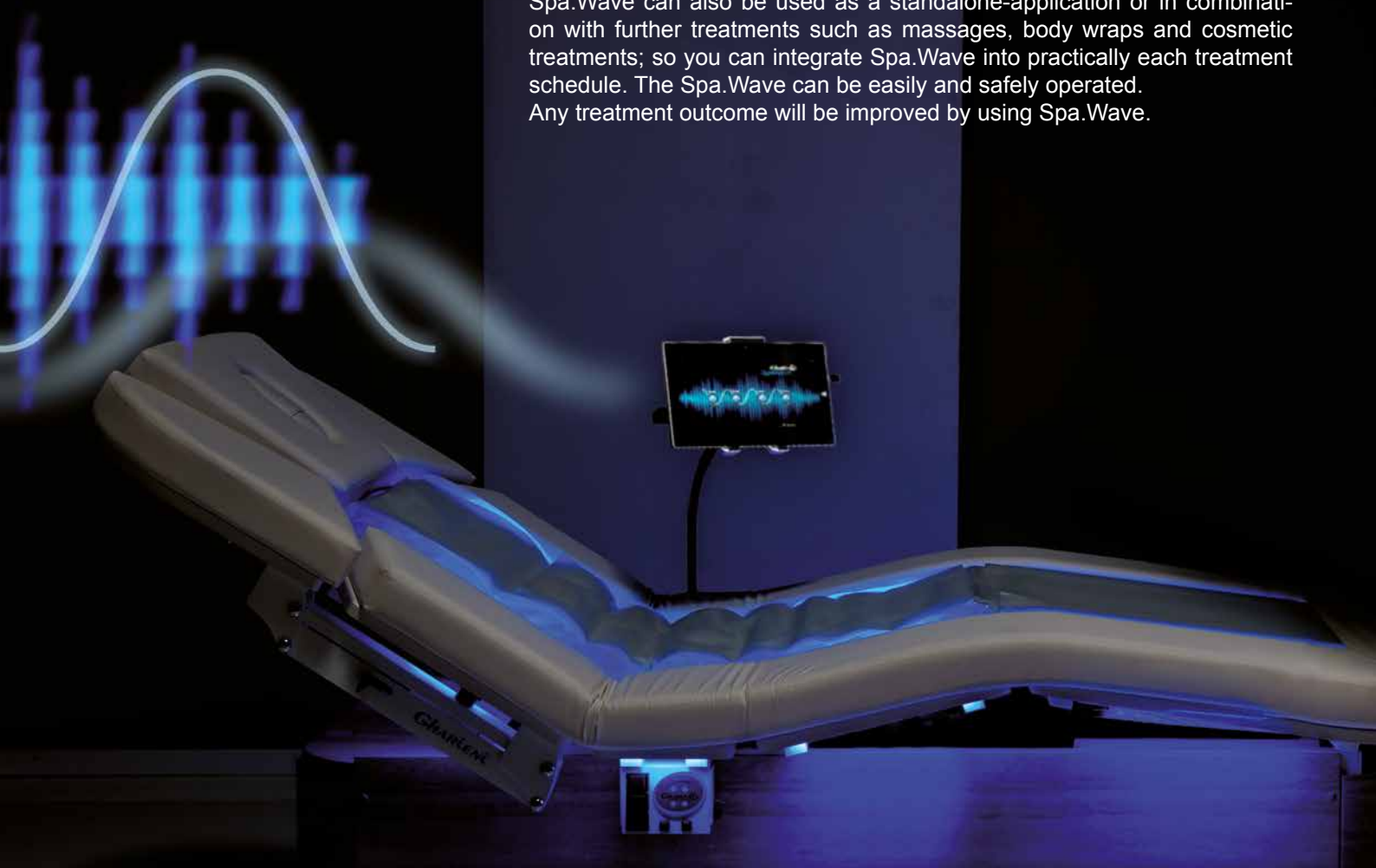
MLW Amphibia with Spa.Wave System

Spa.Wave can also be used as a standalone-application or in combination with further treatments such as massages, body wraps and cosmetic treatments; so you can integrate Spa.Wave into practically each treatment schedule. The Spa.Wave can be easily and safely operated. Any treatment outcome will be improved by using Spa.Wave.