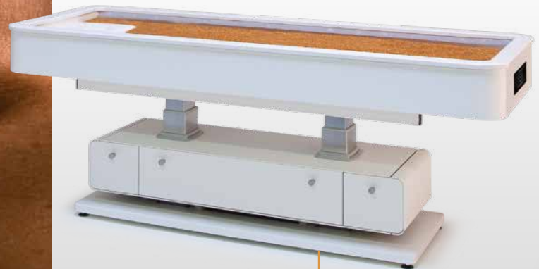
MLX QUARTZ ROUND