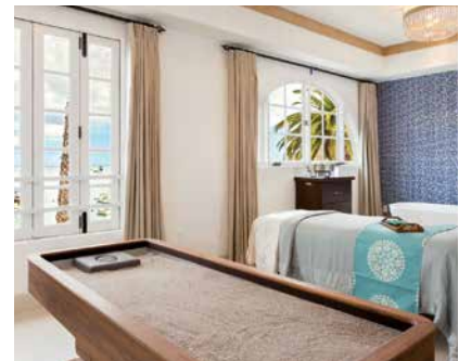
Island Spa Catalina, USA