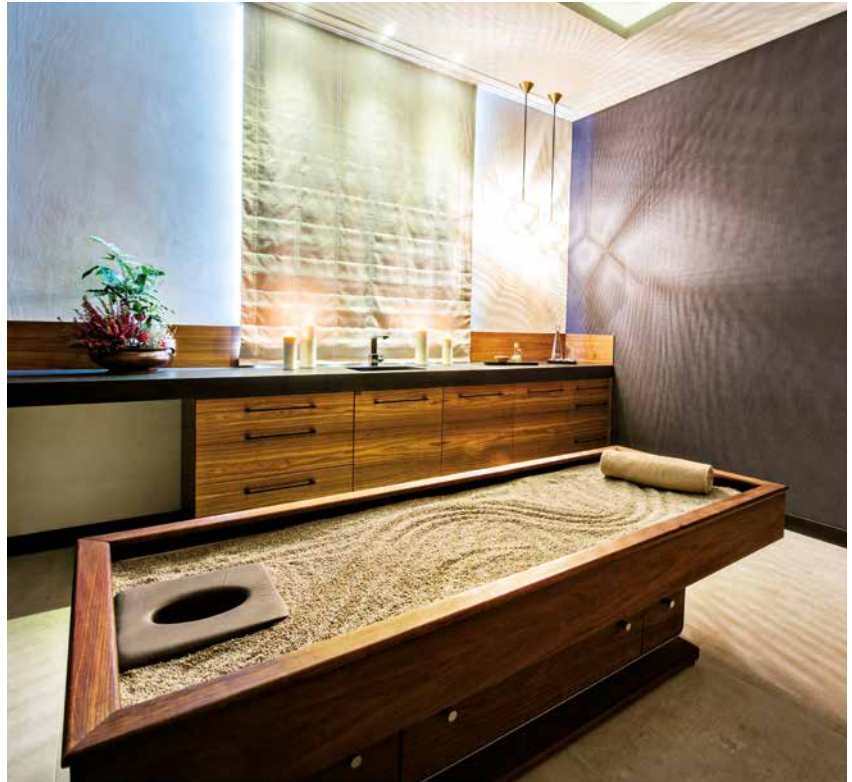
Hotel Arłamów****, Poland