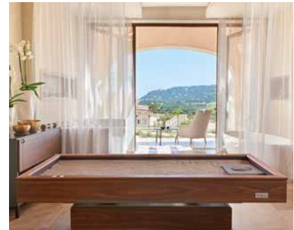
Park Hyatt Mallorca*****, Spain