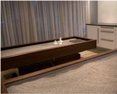
Thermae 2000****, Netherlands