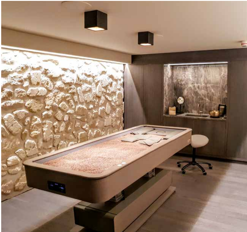
The Lamp Hotel****, Sweden

EXPERIENCE THE PSAMMO CONCEPT HERE & IN MANY MORE PLACES.