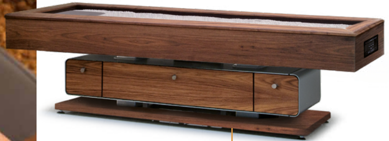
MLX QUARTZ SQUARE