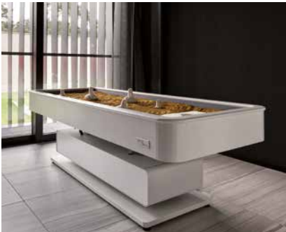
La Butte aux Bois****, Belgium